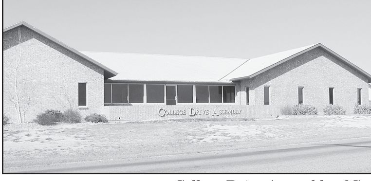
College Drive Assembly of God

Brewster, 785-694-2751. Sunday worship 10:00 a.m.