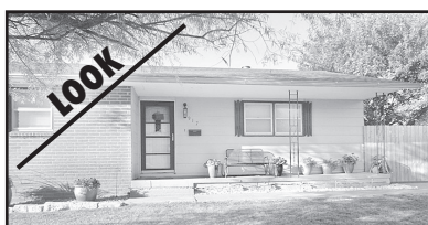
Take a look: 4 BR, 2 Bth, Full bsmt, Deck & More 917 Ct. Terrace $99,500