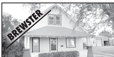
Traditional Home Plus 24x36 Grg/Shop 305 Illinois $68,500