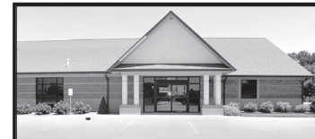
State of the Art Facility PRICE REDUCED TO $650,000