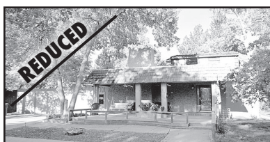
You won't Believe what you see. Over 4,000 Sq feet 670 N. Lincoln $127,500