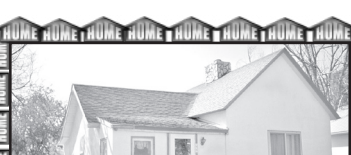
222 ILLINOIS AVE - BREWSTER Price: $27,500 Naomi Ward, Listing Agent