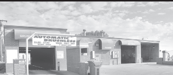
Colby Majic Spray - 4 TH Street Price: $180,000