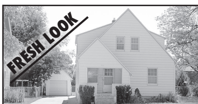
This Home Has Many Improvements. A Must to See 940 W. 2nd $89,900