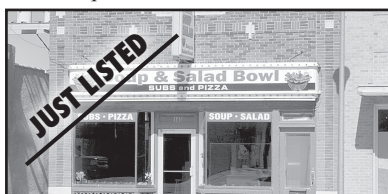
Commercial Building Close to Downtown Call Kevin - 145 W. 4th 443-1722

Like Facebook we are getting closer - 300 likes & Molly gives away a Kindle Fire.