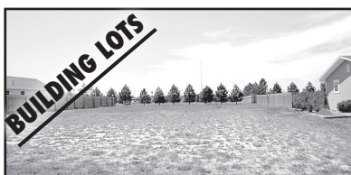
Call Molly Today for list of Home Building Lots!