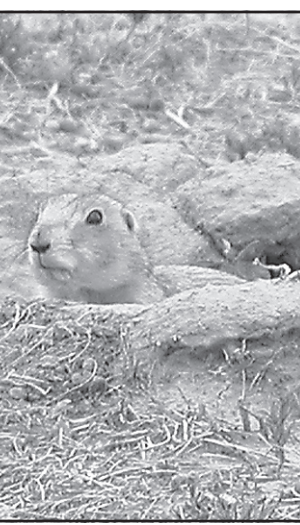
National Weather Service

Tonight: Mostly clear, with a low around 40. Northeast wind 5 to 10 mph becoming south after midnight.