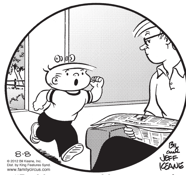
"Daddy, can you blow up our air mattress? You've got more breath than me.'