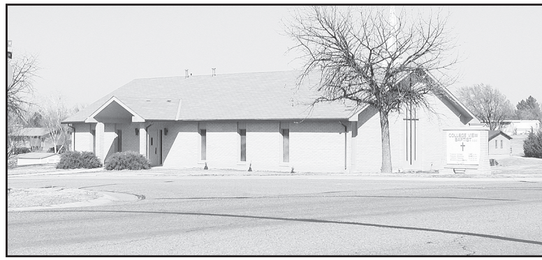
College View Baptist Church