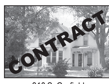
310 S. Garfield