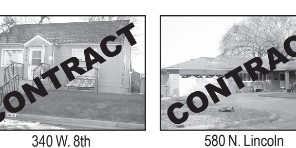
580 N. Lincoln