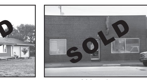
112 Manchester, Brewster