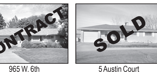
5 Austin Court