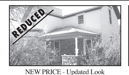
820 W. 4th $92,500