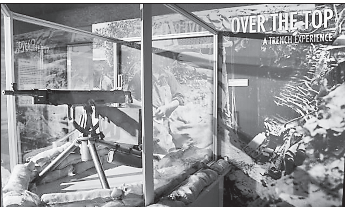
The traveling World War I exhibit features exhibits such as this one showing a machine gun and the trench experience.