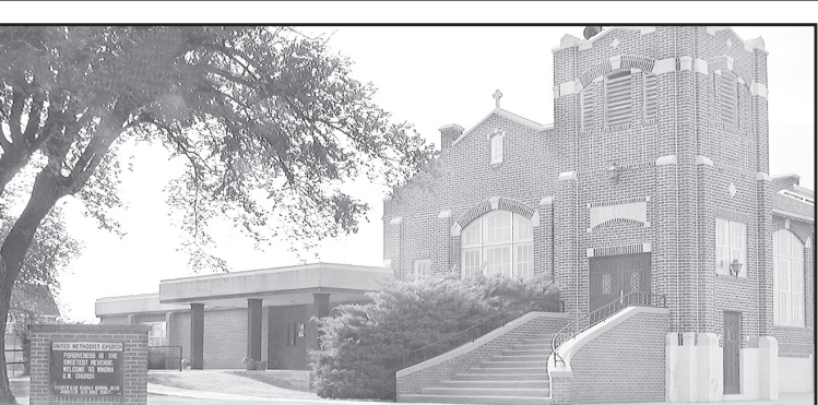
Winona Methodist Church