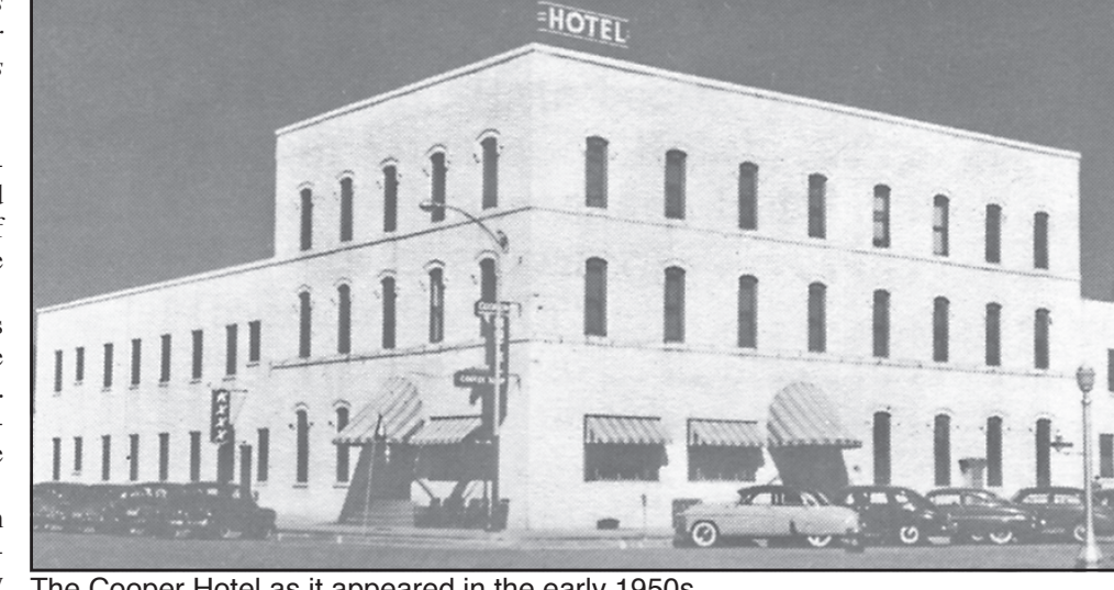
The Cooper Hotel as it appeared in the early 1950s.

Just before Parrott died in 1927, he added a north wing to the hotel and completed a large amount of redecorating. One fire escape had been added to the west side of the building earlier. Before that time, all the rooms were equipped with a coil of rope securely attached