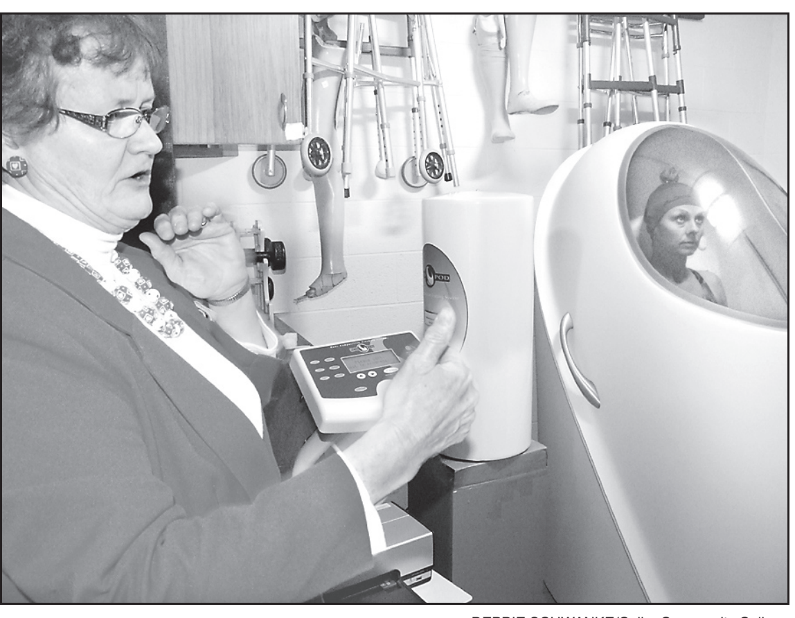
DEBBIE SCHWANKE/Colby Community College