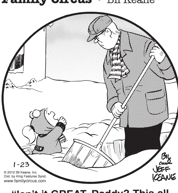
"Isn't it GREAT, Daddy? This all started with just one flake!"