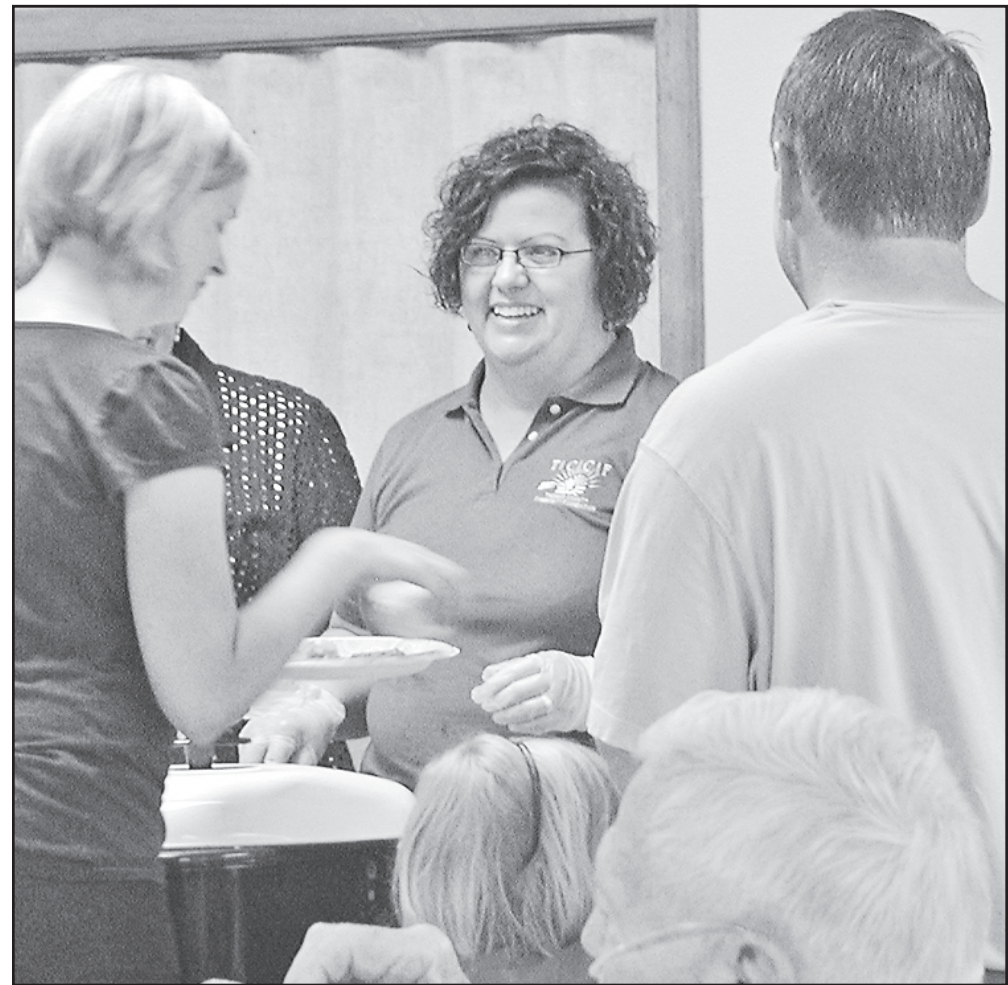
A member of the Thomas County Community Foundation board served a free breakfast at the 4-H building last year during the fair.