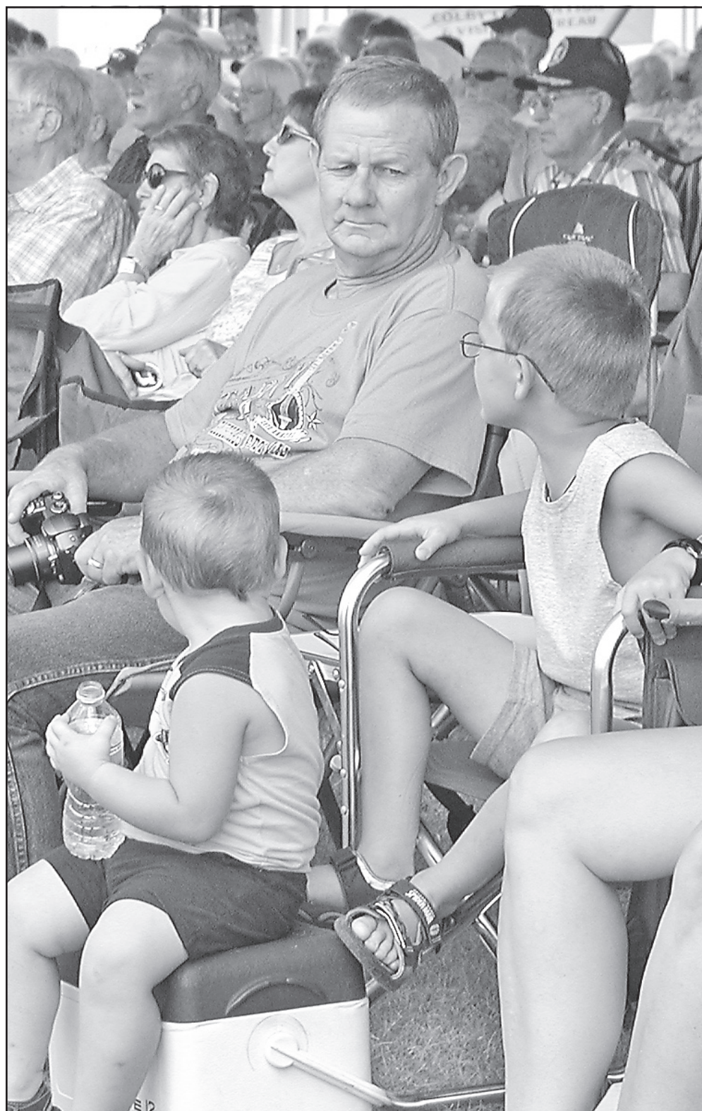
Families made up a lot of the audience at the Pickin' on the Plains Bluegrass and Folk Festival last year. Many brought their own lawn chairs to sit on.

11-12:40 Bluegrass Gospel Homecoming, festival finale