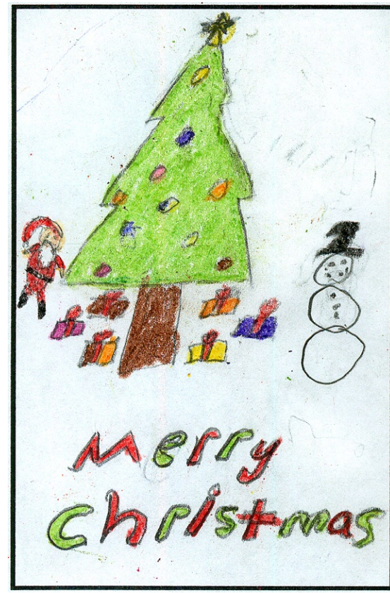
Leonel Aguilar Golden Plains - Bussen