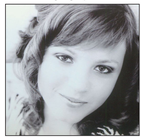
Believe in who you are. Look forward to where you are going and always remember where you came from.