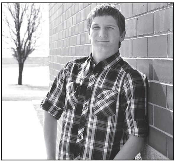
I plan to attend Pratt Community College and major in ag power technology with an associate of applied science degree.