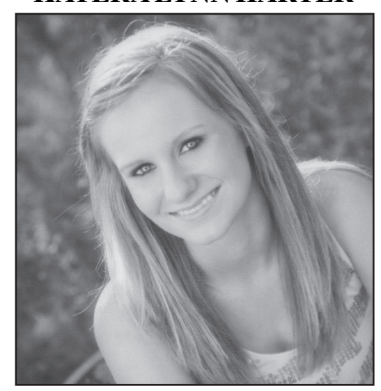
I plan to attend Colby Community College for two years then transfer to Kansas State University to obtain a degree in agri-business.