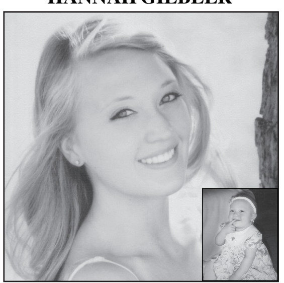
"Ahh the violets: they love to flourish and beneath it's leaves it infuses the air with the most delicate fragrance." May your fragrance be sweet and all your dreams come true.