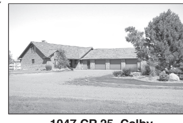
1047 CR 25, Colby

3 Bedroom, 2 bath bungalow, partially finished basement, 1-car garage, and fenced yard w/nice landscaping. Price: $91,900