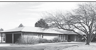
1 Plymouth Drive

Approx. 3,355 sq. ft. one owner brick ranch on 1 acre lot. 3 BR, 3 bath home, full basement, 2 car attached grg, patio, established trees, & on a quiet street. Price: $210,000