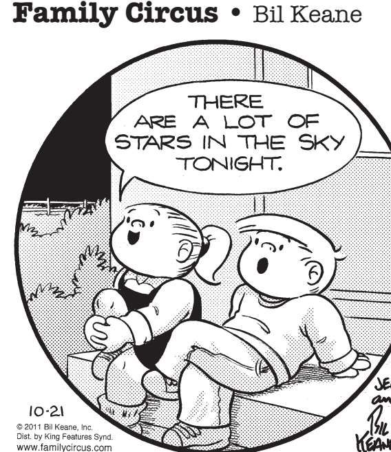
"Where else would they be?"

spade tricks. (c)2011 King Features Syndicate Inc