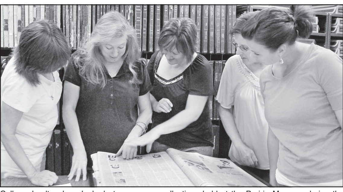
Colby schoolteachers looked at newspaper collections held at the Prairie Museum during the recent mini-workshop.