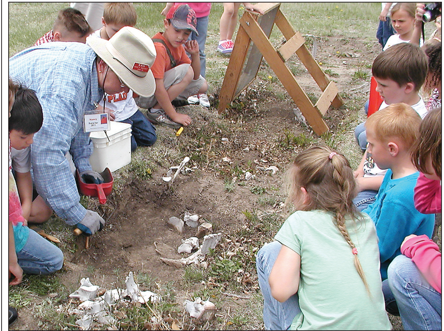
KATHRYN BALLARD/Colby Free Press