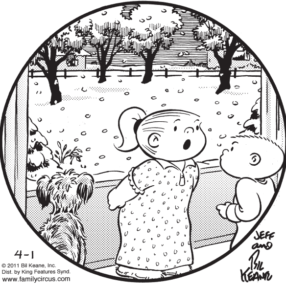
"Is this a REAL snow or just an April Fool's snow?"