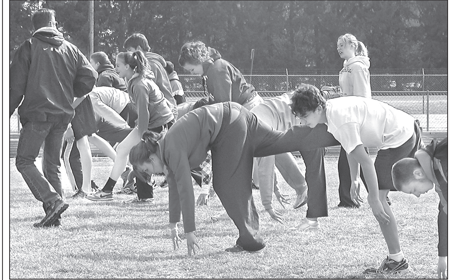
team was scheduled to have its first meet at 1 p.m. today in