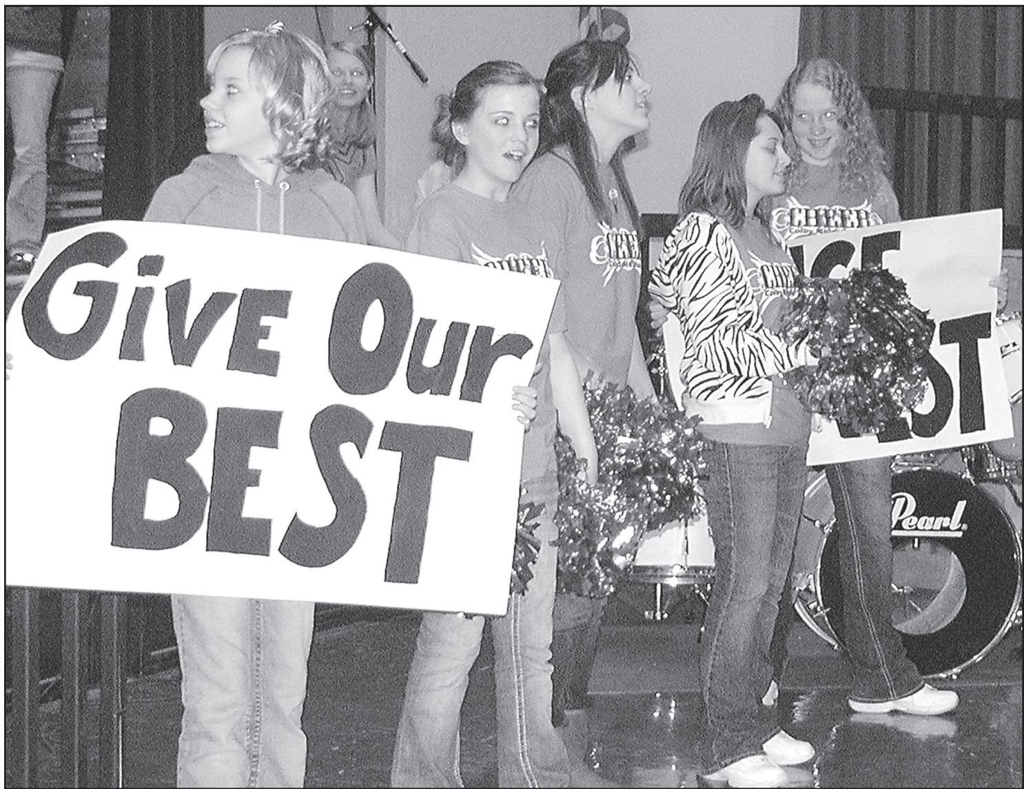
Colby Middle School students got pumped up for their upcoming state assessment tests at a pep rally Monday afternoon.

The rally included skits and a performance by the middle school band.