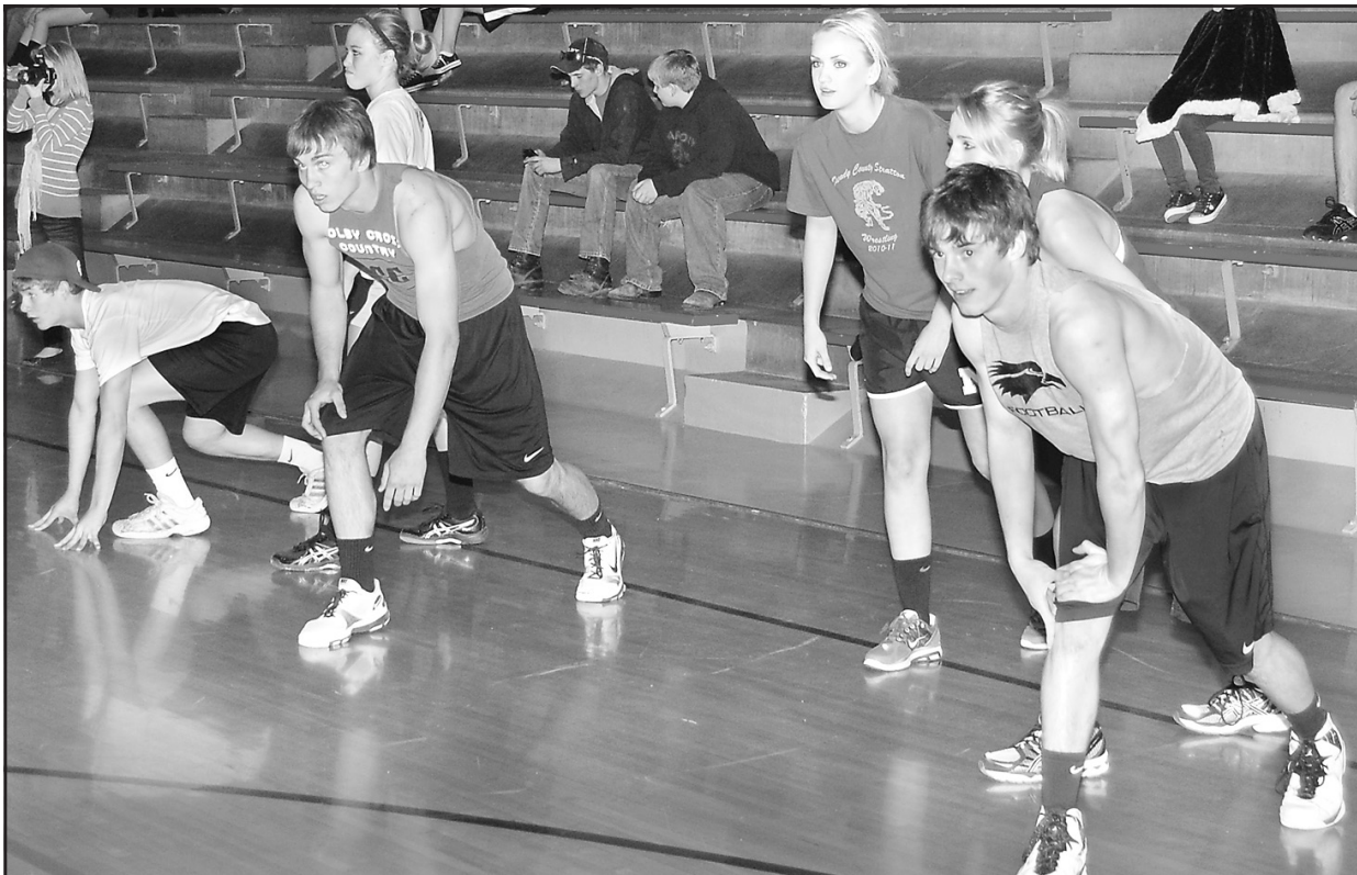
KEVIN BOTTRELL/Colby Free Press