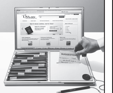
Get info. Find answers. Share ideas. Your connection begins at USA.gov - the official source for federal, state and local government information.