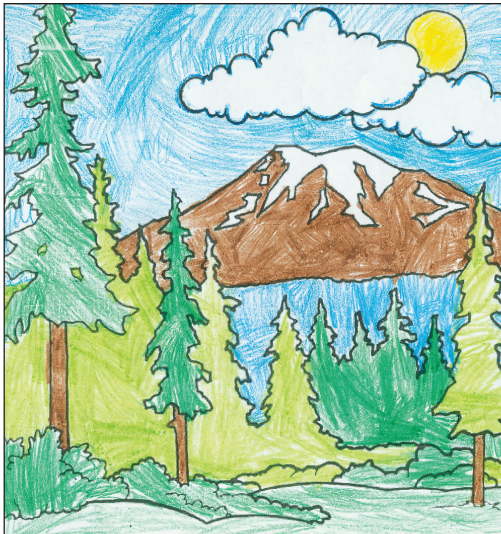
Halle Seiler Sacred Heart First Grade