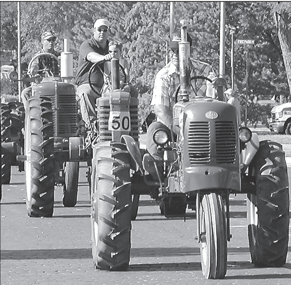
Farm equipment makes up a large number of the entries in the Thomas County Fair Parade. Entries include newer farm implements from local equipment dealers and these classic tractors from collectors. This year's parade will be at 5:30 p.m. Tuesday, July 26, down Franklin Avenue to the fairgrounds.