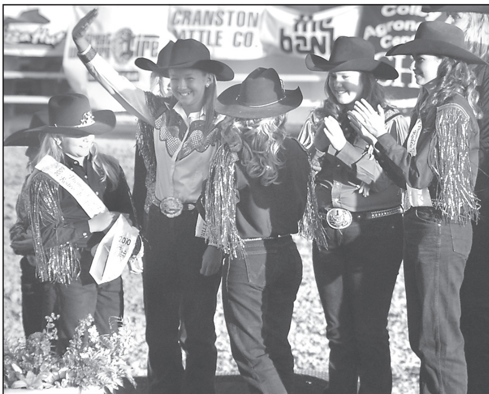
The 2010 Thomas County rodeo royalty were crowned at the rodeo, the Monday of fair week. This year's fair will be Monday, July 25.

The girls are judged on horsemanship, interview, speech and modeling. The speech and modeling events were held at the Colby Community Building. The rest of the competition was at the Thomas County Fair Grounds. All but the interview portion of the competition