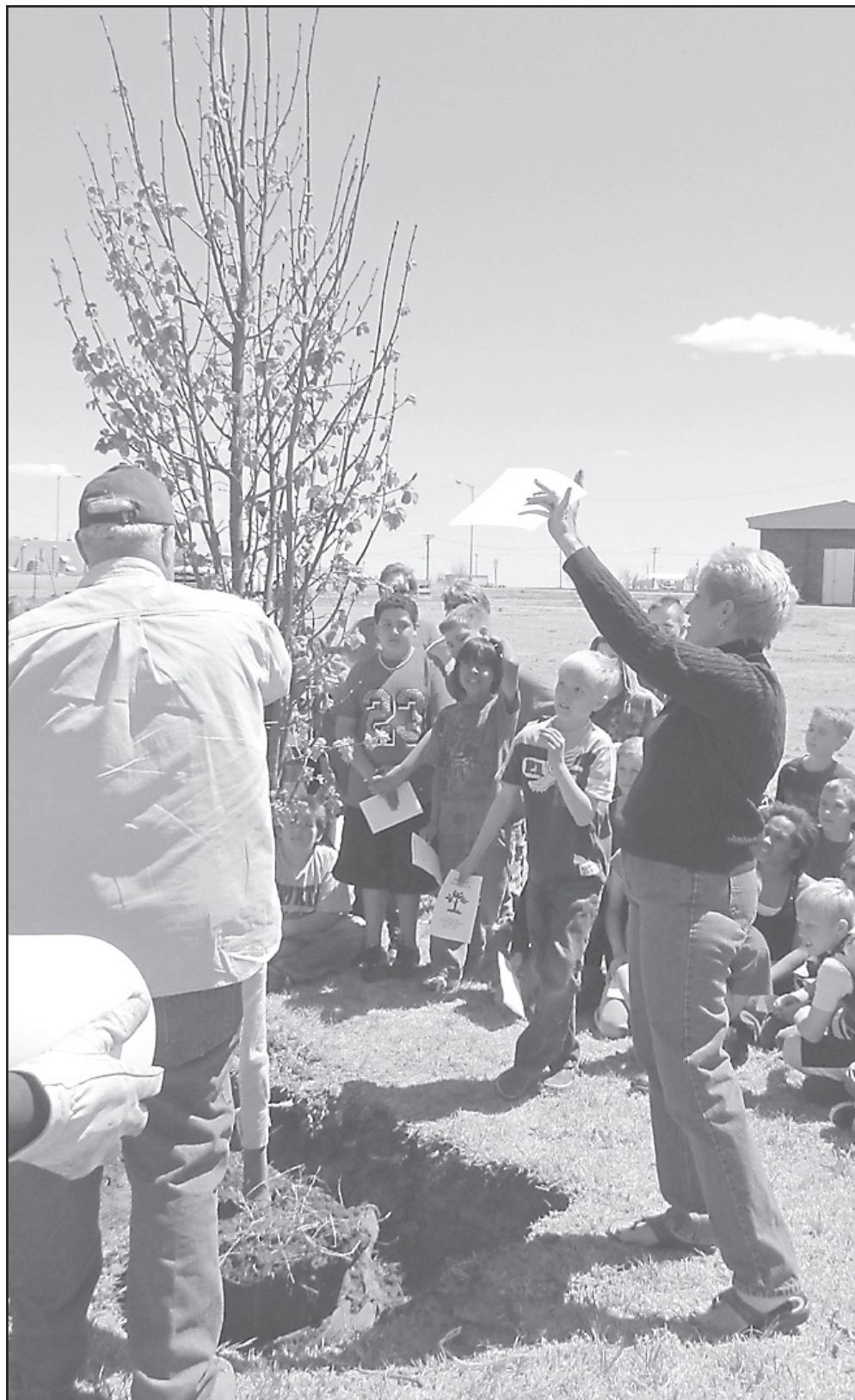
Area kids were invited to a tree-planting ceremony around the Van Gogh painting. Three Linden trees were planted for the 2011 Arbor Day celebration.

The Shine On Sherman County Resource Development Committee and Beautification Committee are trying to raise money for more trees, to add an information kiosk and to maintain the painting. The funds are being raised through a special fund at the Sherman County Community Foundation.