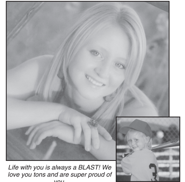
Life with you is always a BLAST! We love you tons and are super proud of you.