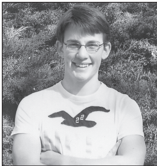
I plan to attend Colby Community College for two years then finish getting a bachelor's degree at Fort Hays State University.