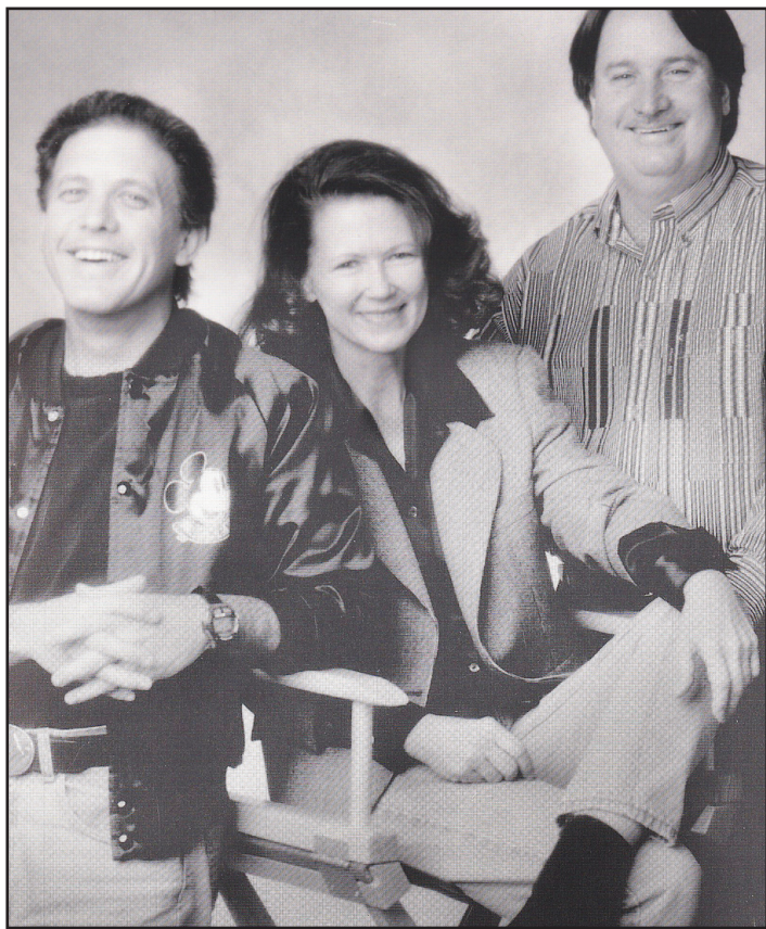
The Starry Night Trio