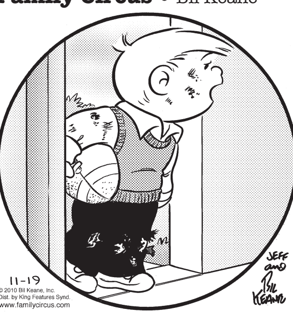
"I forget, are these my GOOD pants or my PLAY pants?"