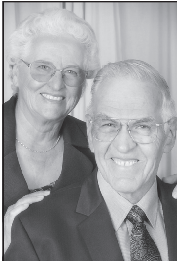
The Quenzers in 2010