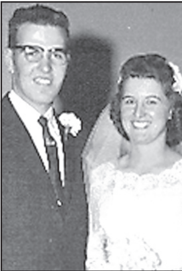
The Quenzers in 1960