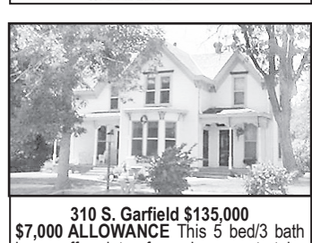
home offers lots of growing or entertaining for your family. Call Marilyn today!

l bdrms. 3 baths. Main floor laundry, 20 30 detached garage & shop. Room to expand!! Call Pat!!