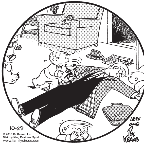
"Oh no! ... It was ME, Daddy! Look! It's only ME, Daddy! ...'