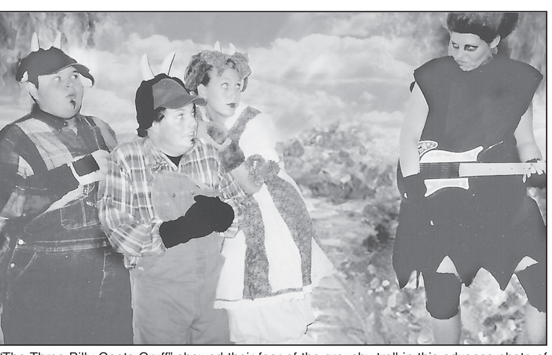
"The Three Billy Goats Gruff" showed their fear of the grouchy troll in this advance photo of the Wichita Children's Theatre production coming to area schools.