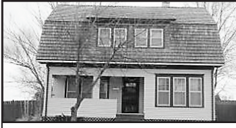
210 W 5th $99,500 2 story Colonial home w/ 3 bedrooms & 2 baths. Enjoy your evenings in front of the living room fire-place & family dining in the formal dining room. Call Marilyn!