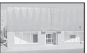
200 N Franklin 13,000+ sq. ft. w/ 5 or 6 offices, 3 bathrooms, 2 parking lots, 3 overhead doors. Call Tom!

LAND LISTINGS - NEW! 480 Acres Rawlins County Cropland & Grass SE of Atwood, Kansas. $825/Acre. Call Rock! 1,680 AC. WALLACE CO., KS Grass & Cropland. 2 Electric water wells. $500/Ac. Call Tom or Rock! 33.3 ACRES LOGAN COUNTY land. Highway 83 frontage. Ideal business location on the North edge of Oakley, Kansas. I-70 within 5 miles. (Can be split.) Call Jerry Wycoff 785-672-0429 80 AC. THOMAS CO. Grass & cropland with Improvements located 3 miles S. of Halford, KS. (UNDER CONTRACT) 480 AC. LOGAN CO sprinkler irrigated 1 mile N of Page City, Ks. 3 wells & 3 sprinklers. (W/ 3 yr. Cash Lease) $2,150/ac. 320 AC. WALLACE CO. CRP & Grass NW Sharon Springs, Kansas $525/Acre. Call Rock L. Bedore 785-443-1653