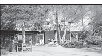
670 N. Lincoln $128,900 Endless Possibilities!!! 3 beds/3 baths and over 4,000 square feet of living space! Call Pat and be the 3rd owner!