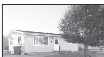
725 Cherokee Dr. $92,000 4 bedroom/2 bath home w/ main level laundry. Insulated 24' X 30' detached garage w/ overhead heater. Call Pat!