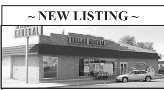
111 W. 3rd, Oakley $210,000 New exterior paint, roof, & side-walk. This property has 10,000+ sq ft with an excellent tenant & great cash flow. Call Rock today!