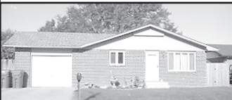
1202 Court Place $105,000 Very nice 5 bedroom/3 bath brick home w/ attached garage. Privacy fenced yard w/ front underground sprinklers! Call Marilyn!