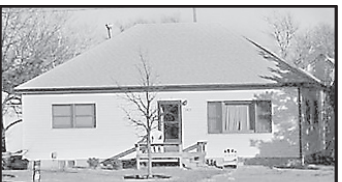
765 S. Range $69,900 4 bdms. 3 baths. Main floor laundry, 20 x 30 detached garage & shop. Room to expand!! Call Pat!!