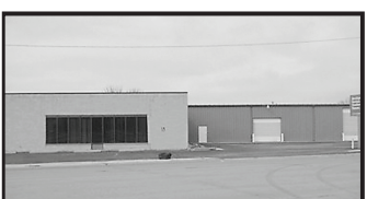
1675 W. 4th 6,000 sq. ft. office/retail bldg. plus 4,500 sq. ft. Warehouse with dock. May be leased. Give Pat a call today!!!

INDUSTRIAL LOT 3.3 ACRES with 7,215 square ft. building, close to Goodland Airport 580 E. Armory Rd, Goodland, Kansas. Great warehouse & office space!! $88,500. Call Tom Harrison 785-443-0136 COMMERCIAL PROPERTY 6.7 acres adjacent to Wal-Mart with I-70 frontage, Colby, Kansas. $750,000. Call Rock. INDUSTRIAL LOT just off of I-70 Exit 53. Colby, KS Great building location. $47,000. Call Rock. LOCATE to Colby's fastest growing Commercial area! I-70 frontage, 2-6 acre lots. Call Marilyn. RESIDENTIAL LOT Woolfer Addition, Colby, Ks. Prime location. (SOLD) 410 N. Franklin Ideal office location, open floor plan, and newer roof. Possible financing or lease. Call Pat for details! 1200 W 4th Colby, KS Very well established & turn key business. $195,000!!! Call Tom. 1690 W. 4th $160,000 Dental care office w/ over 2,100 sq ft. Very well maintained! Give Marilyn a call today!