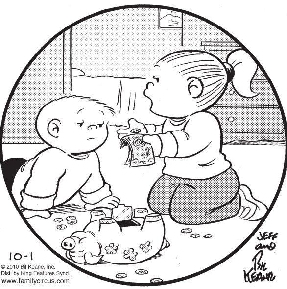
"This is money. You'll start makin' it when you start losin' teeth."