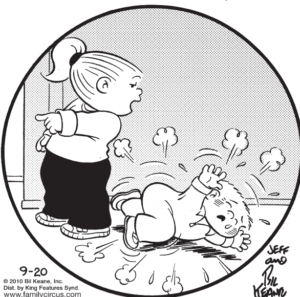
"You should save it for later. Mommy is outside."