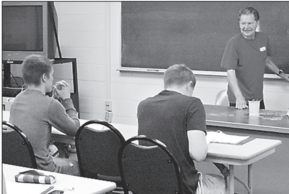
DEBBIE SCHWANKE/Colby Community College

Colby Free Press Wednesday, September 15, 2010 Page 5