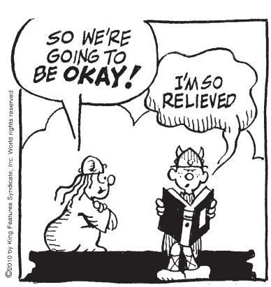
Mother Goose and Grimm • Mike Peters