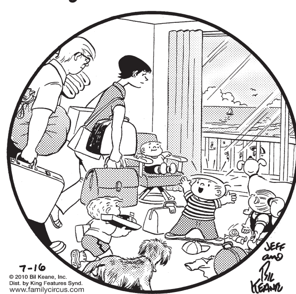
"This is a great vacation place! Can we stay here for a YEAR?"