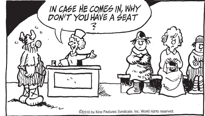
Mother Goose and Grimm • Mike Peters