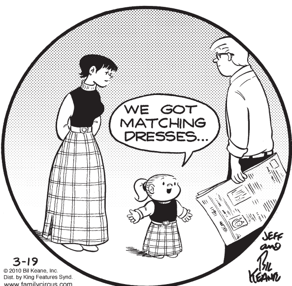
"...'cept Mommy's came with more curves and things."