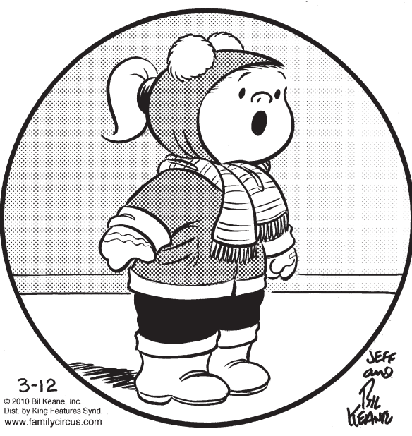
"I'm too warm. Can I bundle down?"