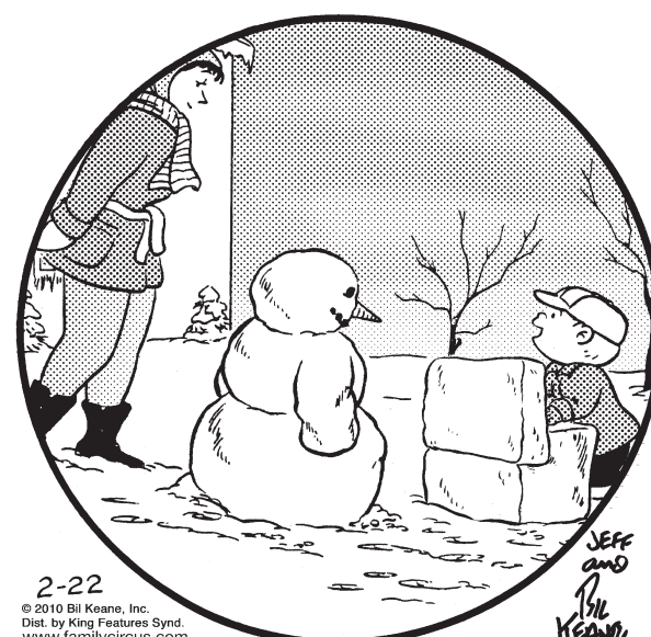
"It's a TV set. He wanted to watch the Olympics."