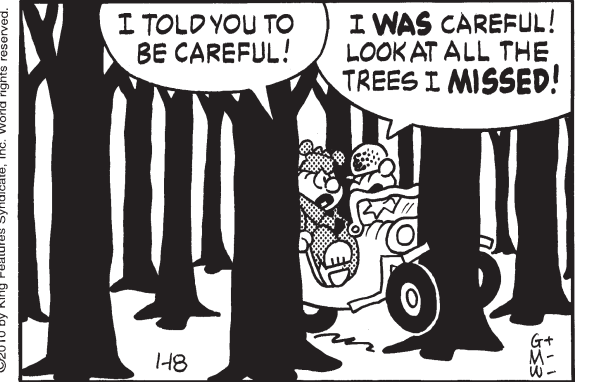
Blondie • Chic Young