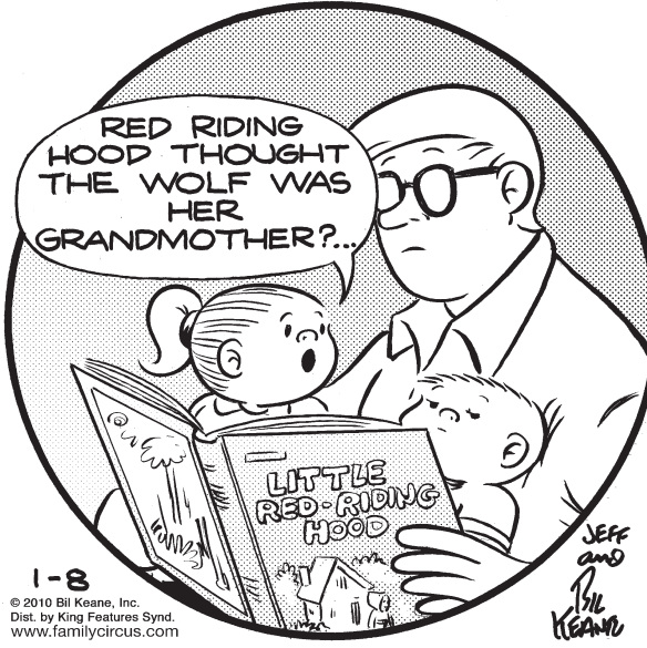
"... sounds like she needs to get some glasses."