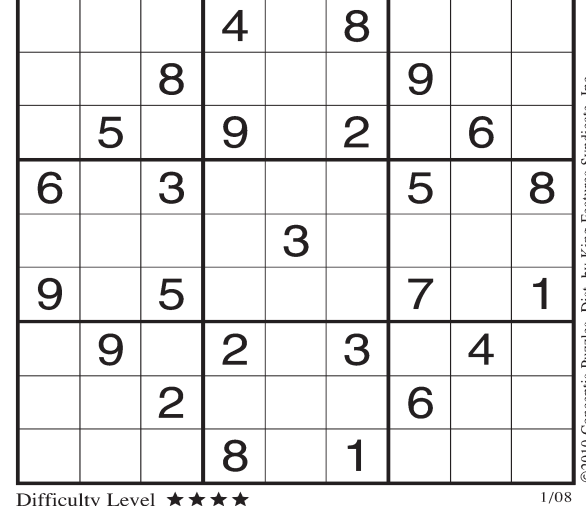
Difficulty Level ★★★★

This is a logic-based number placement puzzle. The goal is to enter a num-