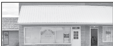
115 Center Ave. Oakley Good investment property. Ideal commercial location. Remodeled & updated. Call Jerry to see.

COMMERCIAL DEVELOPMENT 6.7 acres adjacent to Wal-Mart with I-70 frontage. Located in Colby, Kansas. Call Rock. COMMERCIAL LOT in Colby's Industrial Area just off of I-70 Exit 53. Great building location. $47,000. Call Rock. LOCATE to Colby's fastest growing area. I-70 frontage, 2-6 acre lots. Join Colby Petro, Colby Implement and others. Call Marilyn. 9 UNIT MOBILE HOME PARK on West edge of Colby. Good rental history and management available. Call Pat. 310-316 W 7th Oakley Well maintained brick 4-plex. Maintenance & updates have been done. Good rental history. Call Marilyn. 206-208 Plum Oakley Duplex. Great rental history. 2 bdrm, 1 bath, 1 car attached garage each unit. Call Marilyn.