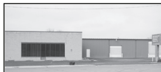
1675 W 4th Colby 6,000 sq. ft office/retail building plus 4,500 sq. ft. warehouse with dock. High traffic area.

480 ACRES THOMAS CO. irrigated & grass 4 West of Oakley $984/ac. 480 ACRES LOGAN CO. Cropland & grass SW of Oakley, KS. (Under Contract). 35 ACRES Close to I-70, Range Ave., Colby, Kansas. $15,000/acre. RESIDENTIAL LOTS Located South of Dillons, Colby, KS. $6,500 per lot. 148 ACRES RAWLINS COUNTY Cropland and grass 4 1/2 miles North of Ludell, Ks. Cash rents going to Buyer. $757/acre. Call Pat 785-443-3261. 640 ACRES GRAHAM COUNTY CRP with irrigation wells and water rights Northwest of Hill City, Kansas. (Immediate Possession). $850/acre. 400 ACRES LOGAN COUNTY grass & cropland w/improvements located at Page City, KS. Beautiful 2 story home, barn, cattle working facility, Quonset, grain storage and cattle feeding pens. PRICE REDUCED !!! 480 ACRES LOGAN COUNTY sprinkler irrigated land located 1 mile North of Page City, KS. Excellent farmland with 3 wells & 3 sprinklers. $2,150/ac. 615 ACRES LOGAN COUNTY Cropland and grassland located 1 mile North of Winona, KS. PRICE REDUCED !!! (UNDER CONTRACT) 35.5 ACRES THOMAS CO. Grass 5 NW of Colby, KS. UNDER CONTRACT !! Call Rock L. Bedore 785-443-1653