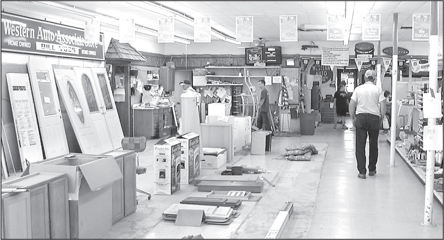
Beringer Hardware has finished moving to its new location on South Range Avenue. The final day in the old building on Fourth Street was Saturday. While merchandise was still available on