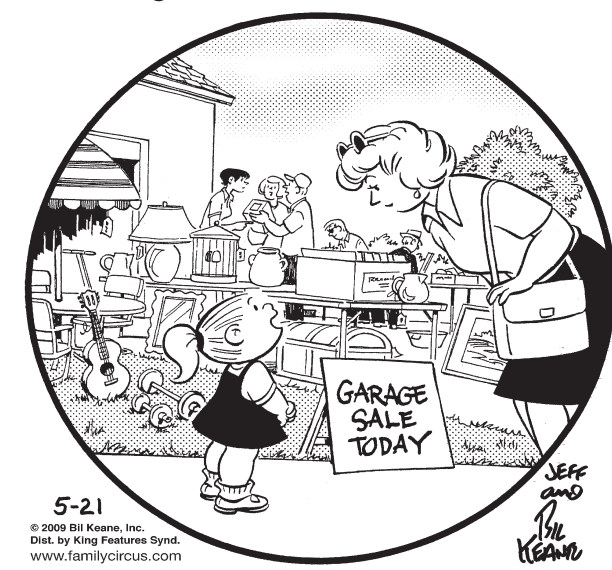
"...then my mommy said to daddy, We'll get rid of all the junk around this place.<sup>3</sup>