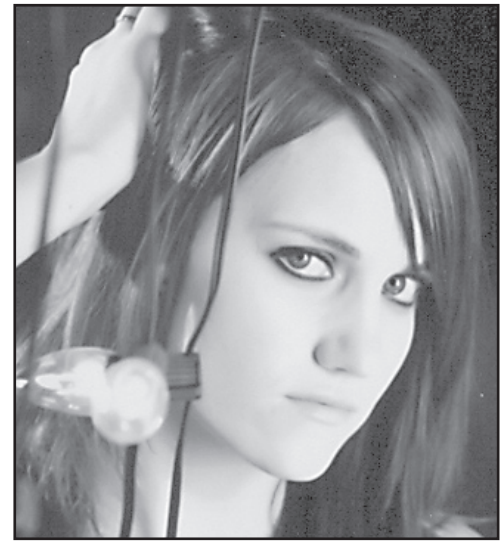
I plan on attending Washburn University, majoring in nursing.